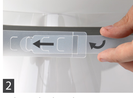
Adjust the head strap to fit comfortably

DEM is a British fully certified medical equipment manufacturer exporting worldwide