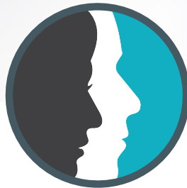
FULL FACE PROTECTION